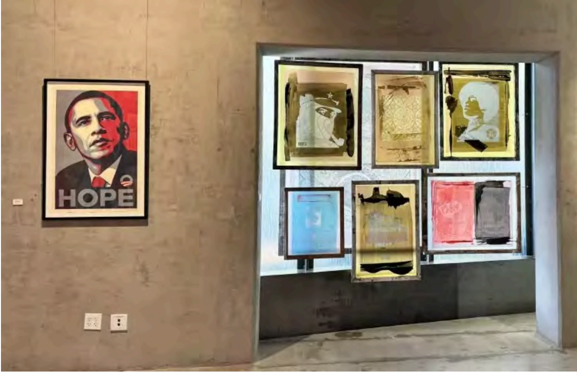
"Peace is Radical" features Shepard Fairey's iconic "Obama Hope" poster, as well as "Unlimited Screen Time," an installation of various screen printing frames.