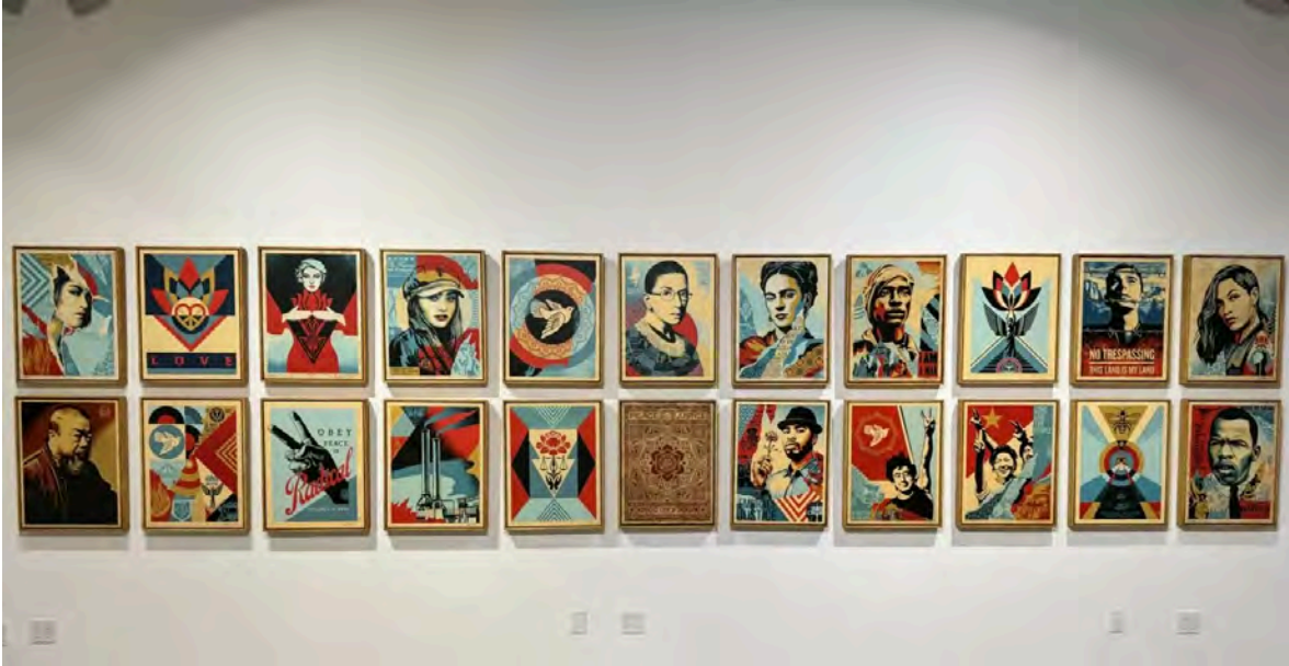
First published in the March 9 print issue of the Glendale News-Press.